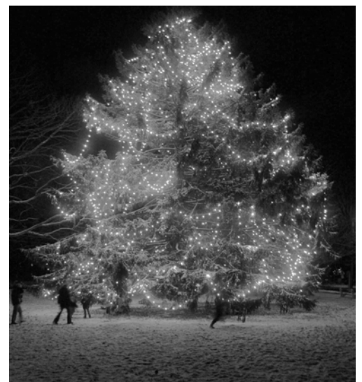
The Nichols Tree.