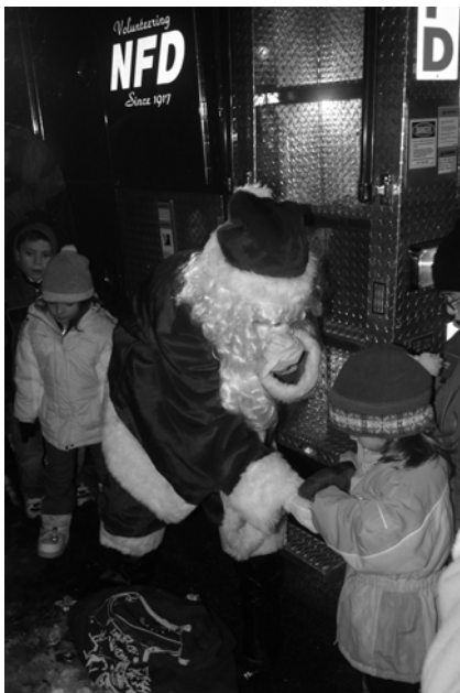
Santa handing out goodies.